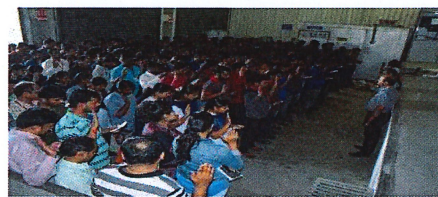
AQ employees in India take an oath to comply with AQ Group Core Values

In addition to this AQ is supporting the Hand in Hand foundation in India . We donate money to prospective entrepreneurs in the village to help them to a better life. During 2020 the support have been directed to prevent Covid-19 spread.